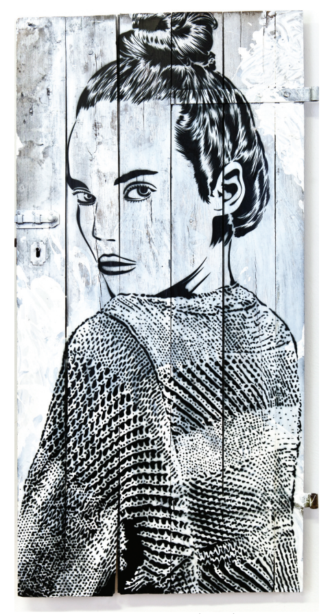
X0000X, Transformer VI (Pulsar), 2013, spray paint and acrylic on wood and metal, 65%" x 33" x 4%". De Buck.

Transformer VI (Pulsar) , 2013, exemplifies his approach to portraiture. It's